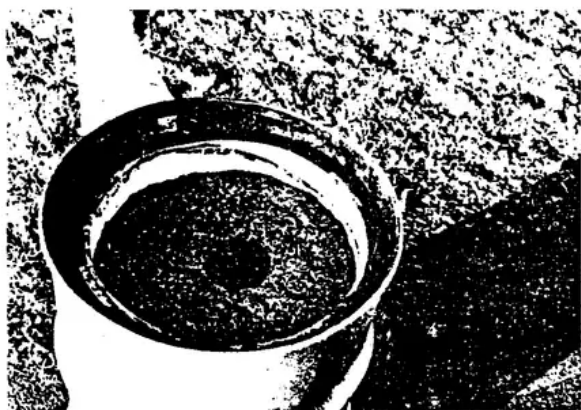
Figure 3.—The stove filled and ready for firing (lid removed). Notice the hollow center in the fuel charge.

To fill the stove, place the small end of the wooden mold in the hole at the bottom of the inner barrel. Then tamp sawdust or bark around it until the inner barrel is full. Wet fuel should not be tamped as much as dry fuel. Carefully remove the mold, leaving a vertical hole in the center of the fuel charge (Figure 3).